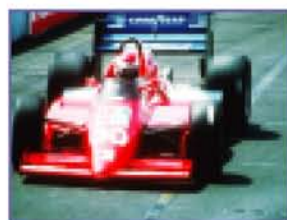
Video without Progressive Scan