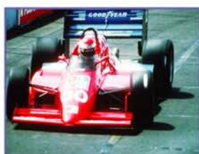
Video with Progressive Scan

With world-leading Progressive Scan technology, you will see no flicker , and it will deliver a sharper, clearer picture .