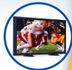
16:9 Wide Screen