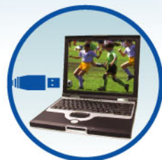
Plug and Play