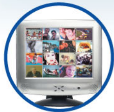
Auto Channel Scan