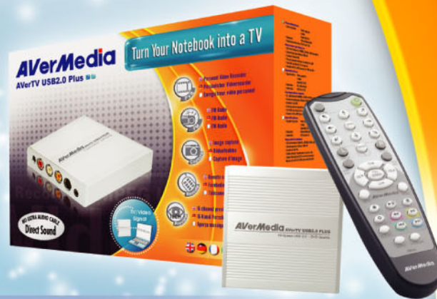
AVerTV USB2.0 Plus