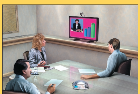
Corporate. Deliver a presentation they'll remember using the LCD4000 or LCD3000. Ideal for board rooms, conference rooms and large offices, the monitors' ability to display crystal-clear text and precise images add clarity and profoundness to spreadsheets, documents and graphics-based presentations. Picture-in-picture capability allows your group to simultaneously view multiple applications, such as a spreadsheet and full-motion video conference.