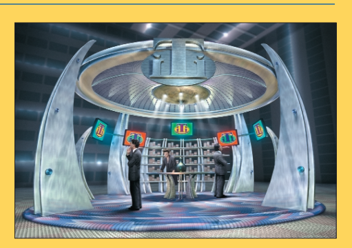
Tradeshows. With a multitude of exhibitors vying for the attention and time of tradeshow visitors, it can be difficult to stand out from the crowd. The LCD4000 and LCD3000 help your exhibit become the center of attention with their amazing screen performance. Their brightness and dynamic design will draw interest, while Rapid Response and a high contrast ratio allow you to effectively demonstrate your company's message. The lack of permanent phosphor image burn-in extends the displays' lives and protects your investment.