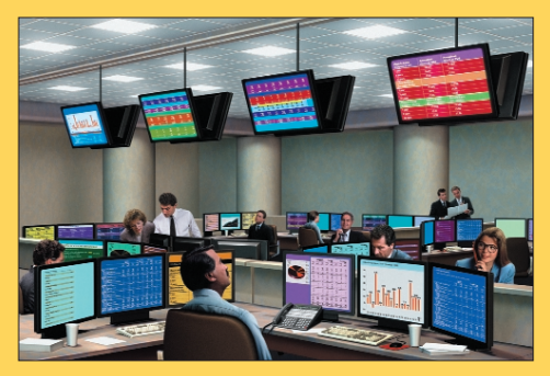
Financial. In the fast-paced financial market, information needs to be relayed in real time. The LCD4000 and LCD3000 are capable not only of displaying on-the-fly market data and other vital information without distortion, but do so using crisp text and a high-bright backlight for easier readability.

CableComp technology solves these dilemmas by using a digitized signal delay circuit to automatically compensate for each red, green and blue cable's length and video signal delay, ensuring sharp image reproduction. CableComp also boosts the VGA video signal to prevent blurred images without the need for costly repeaters.