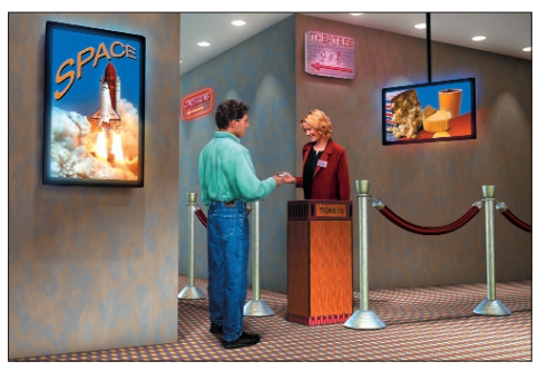
Advertising. With their high resolution, bright display and lifelike colors, the LCD4000 and LCD3000 are unrivaled in drawing consumer attention. Spread the word on your products and services to moviegoers, advertise the latest sale items at a department store or attract the eyes of passersby in the storefront of a clothing store. No matter the outlet, these displays stop consumers in their tracks.