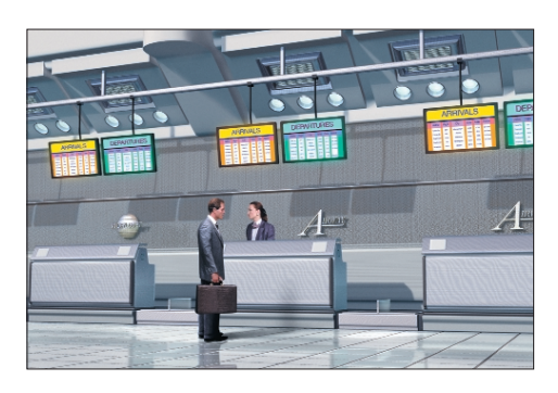
Information Display. Make a lasting impression on the public eye with the LCD4000 and LCD3000. Whether the displays are placed in airports, train stations, restaurants or kiosks in any interior environment, their spacious screens are guaranteed to turn heads and feed useful information to passersby. With XtraView wide-angle viewing technology, it doesn't matter if they're directly in front of the screen or passing by—an ideal view is assured.

And you thought LCD monitors were used only on desktops. With space conservation a major concern for all types of markets in today's business world, the LCD4000 and LCD3000's space-conscious designs allow them to fit comfortably into almost any application for maximum impact to viewers. Wall mounting, custom-made cabinets and hanging fixtures are just a few of the options you have when choosing your display installation for these displays.